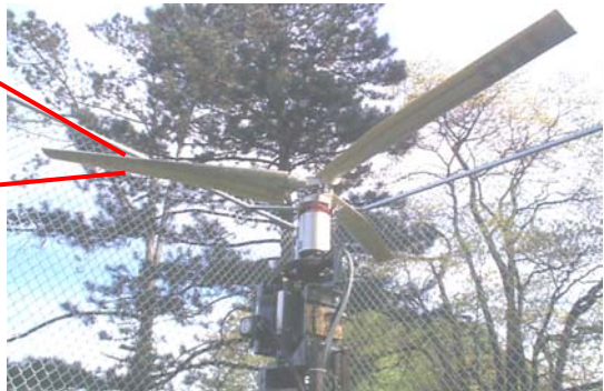
1/5 scale blade with SMA flaps tested on CDI hover stand

Model-scale flapped rotor demonstrated simultaneous flap deployment and validated predictions of flap effectiveness on a 1/5 scale V-22 blade system.